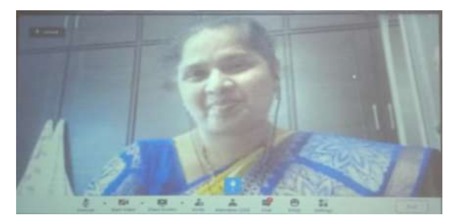
Workshop on "Cyber Security"