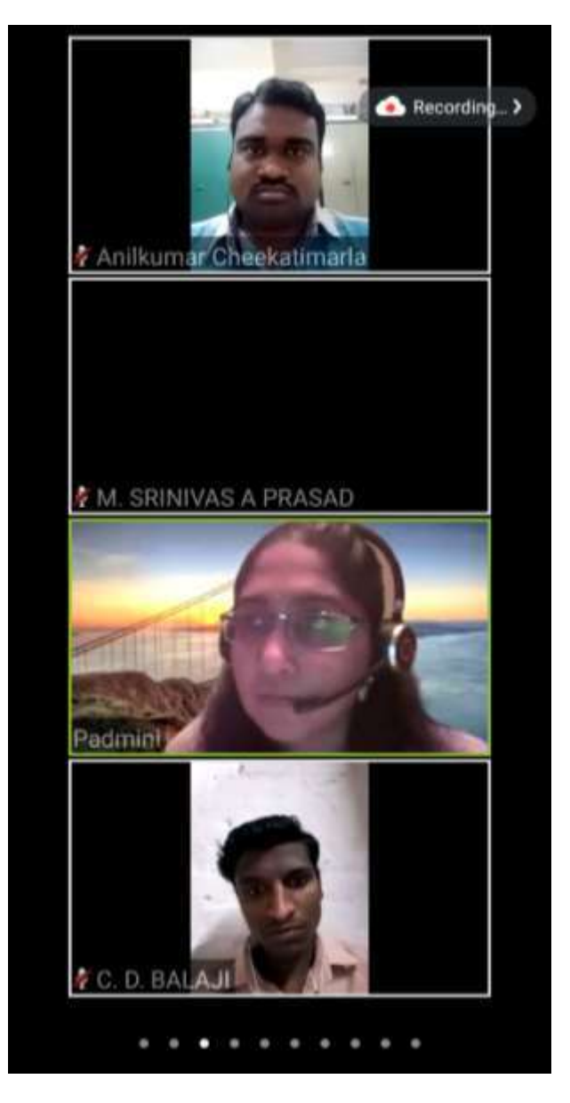
Webinar on "Career Guidance for Interview Success"