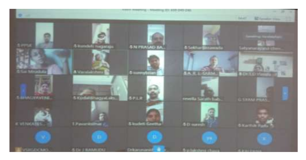
Webinar on "Employability Skills and Emotional Intelligence"