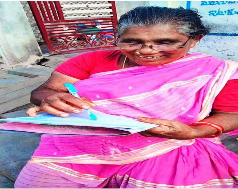
After Completion of the Adult Literacy Program the illiterate women putting signature in the register.