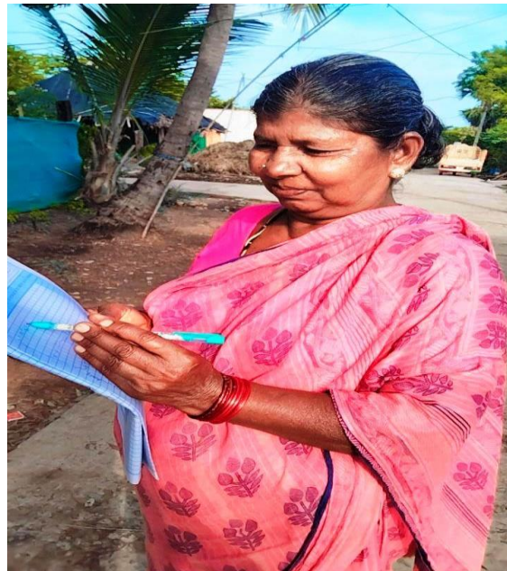
After Completion of the Adult Literacy Program the illiterate women putting signature in the register.