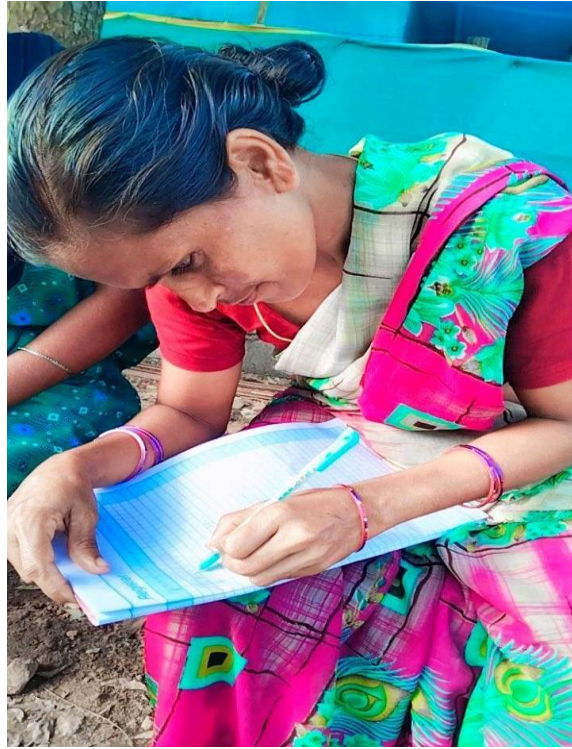
After Completion of the Adult Literacy Program the illiterate women putting signature in the register.