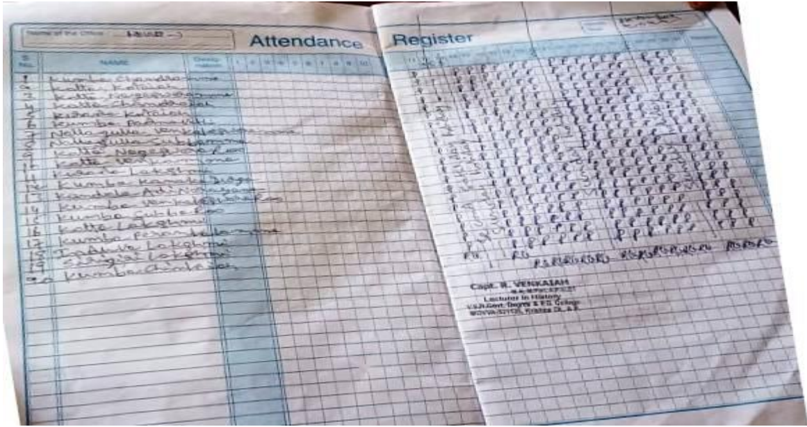
Adult Literacy Program :Attendance Register of the illiterate Students.