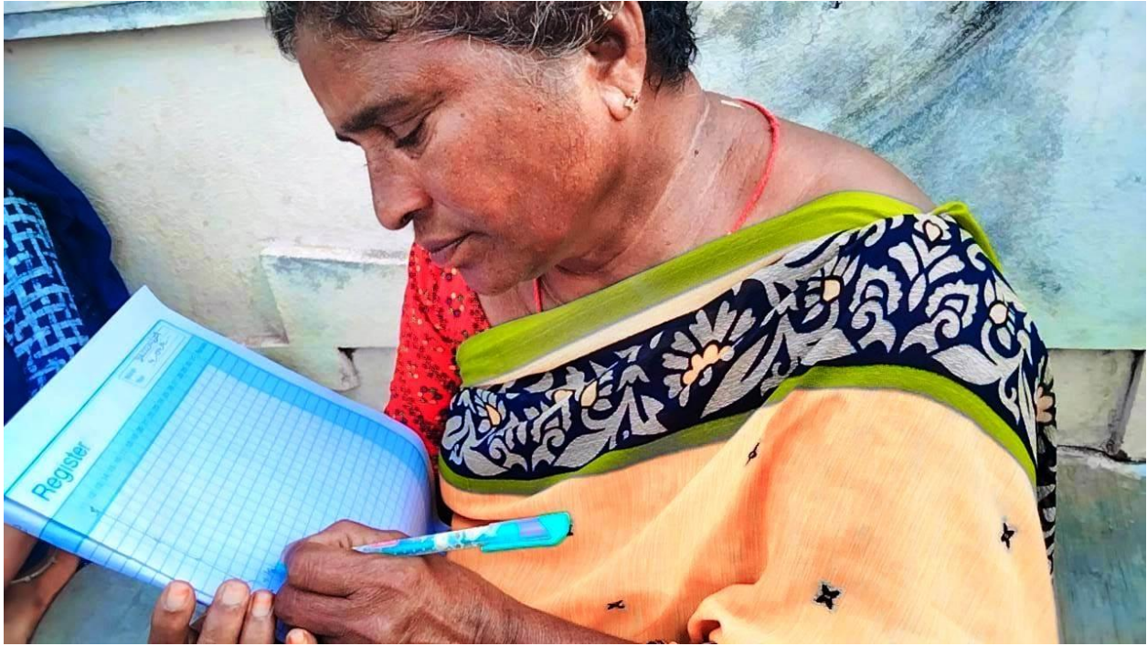
After Completion of the Adult Literacy Program the illiterate women putting signature in the register.