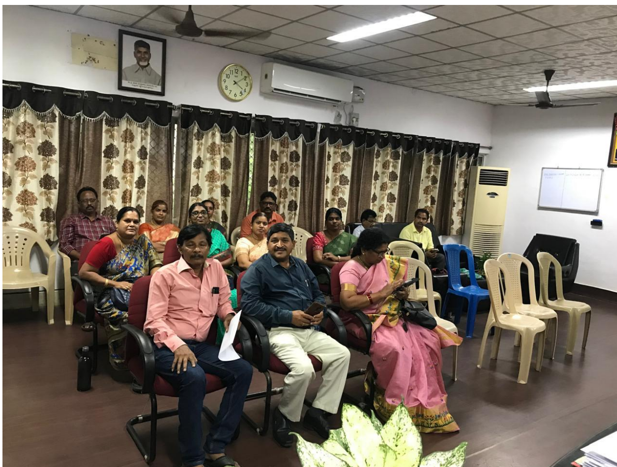
Renewal of contract faculty for the academic year 2023- 2024 was held on 12 July 2024