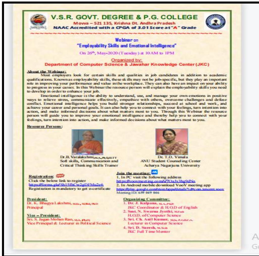
Brochure of the Webinar on "Employability Skills and Emotional Intelligence" on 26/05/2020