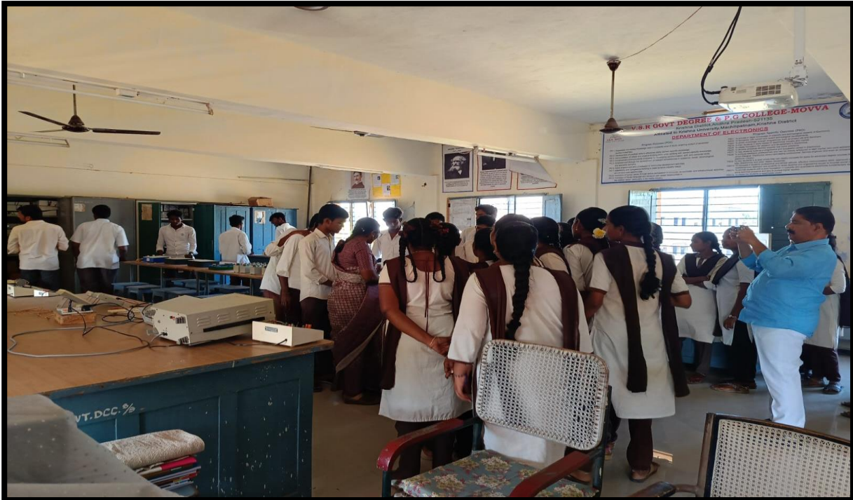
Kshetraiah Govt.Junior college, Movva students visited Electronics Lab