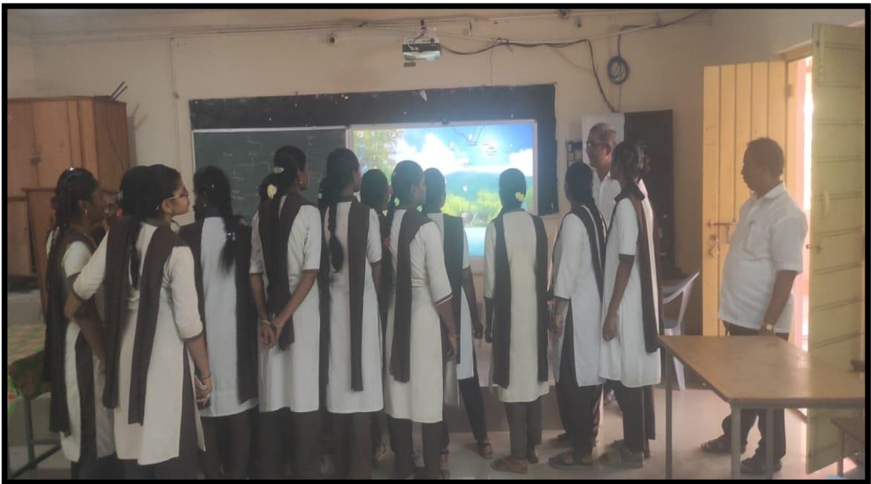
Kshetraiah Govt.Junior college, Movva students visited Computer Lab