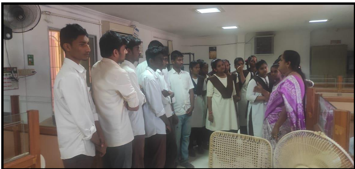
Kshetraiah Govt. Junior college, Movva students visited JKC Lab