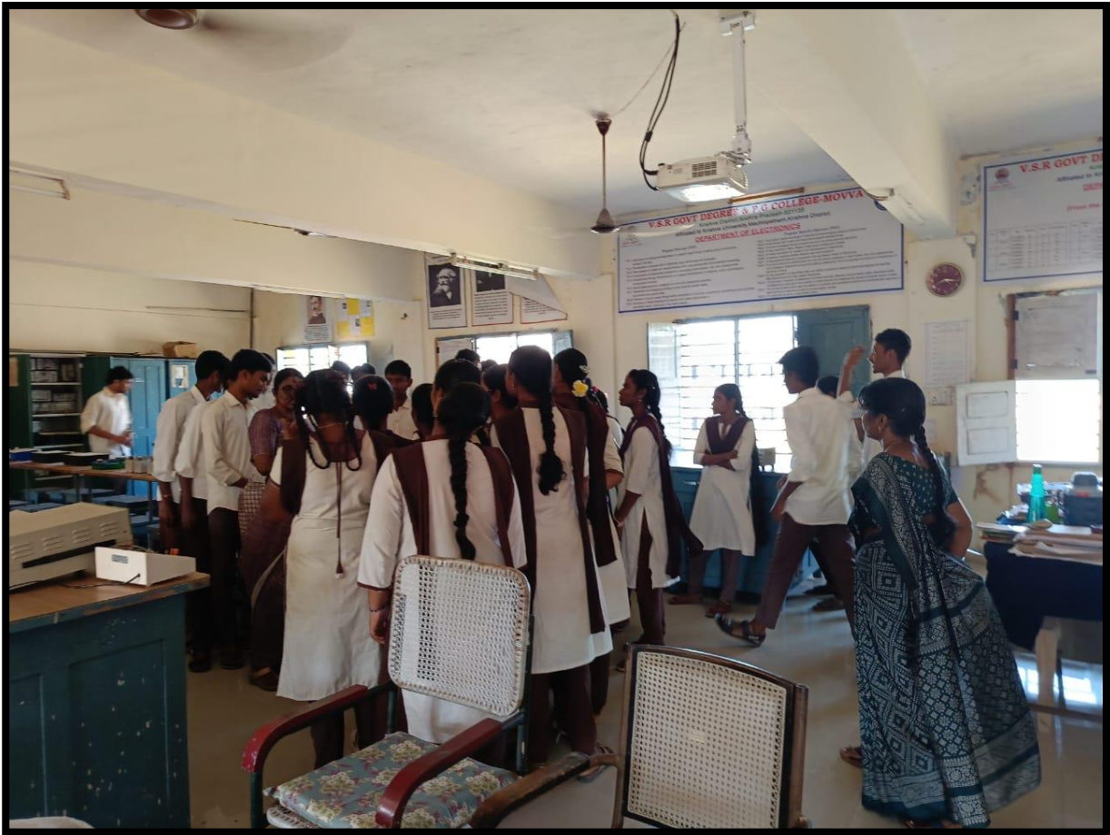
Kshetraiah Govt.Junior college, Movva students visited Electronics Lab