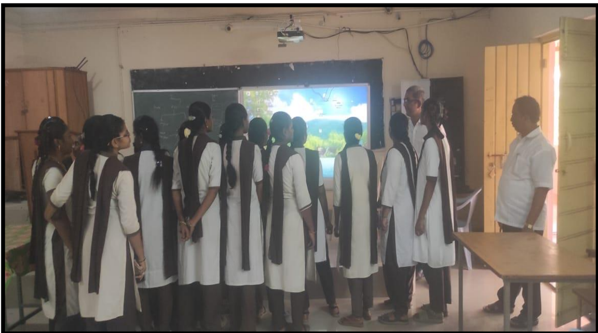
Students visited Physics Lab