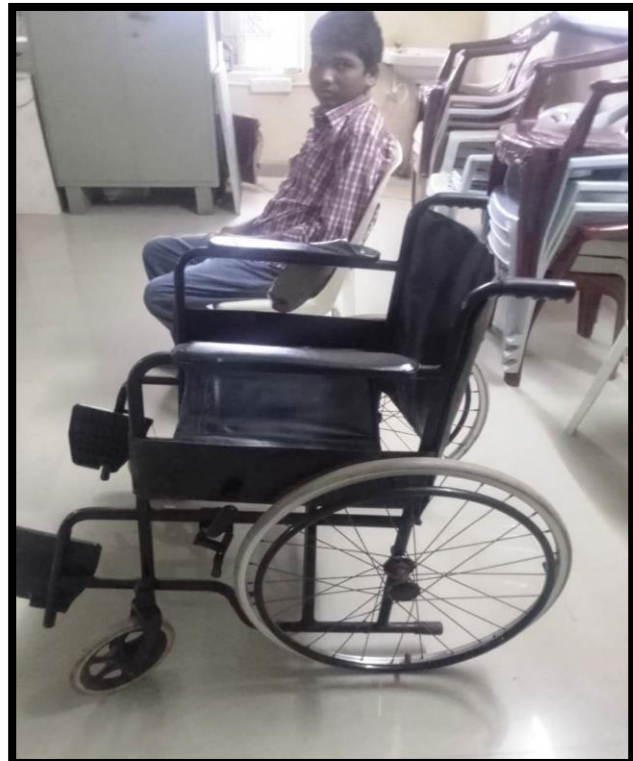
Wheel chairs are strategically placed near ramps